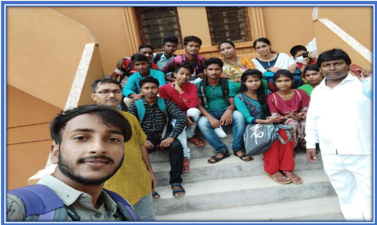
TEACHERS' DAY CELEBRATION